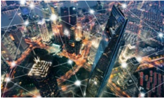
Energy Cloud 4.0

Click the insights below to explore some of our latest thought leadership.