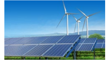
State and Future of the Power Industry