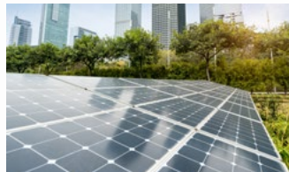
Financing the Energy Transformation