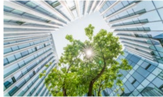
Navigating the Decarbonization Journey