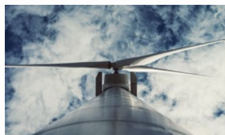
Dutch Offshore Wind Market Update