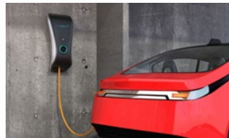
Transportation to Grid