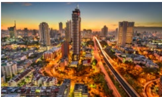
Impacts of COVID-19 Executive Pulse Survey